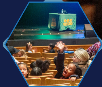
Kids & The Arts