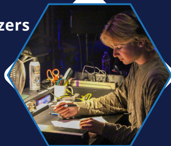
Youth Workforce Development